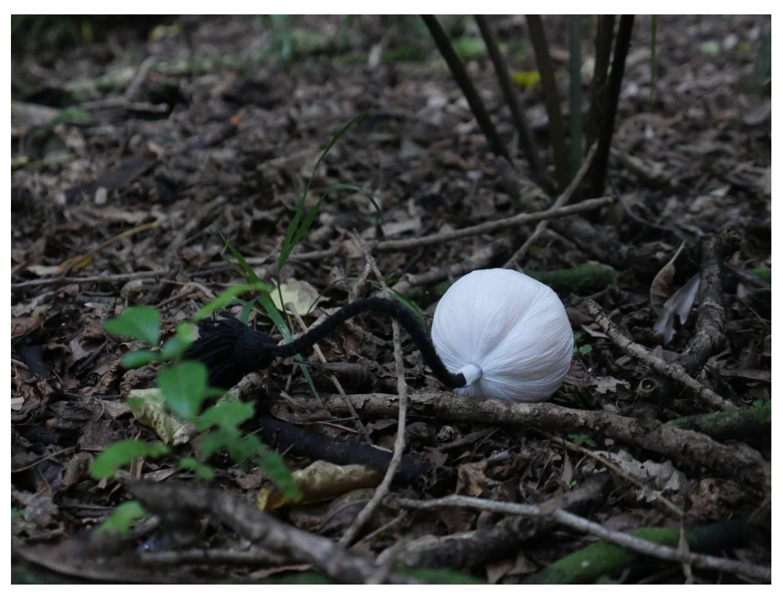
Mate atu he tete kura, ara mai he tete kura.